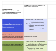
Goal Setting template - Tuesday afternoon